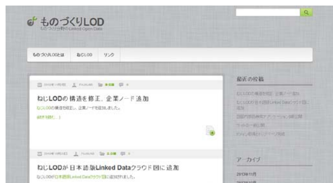
Fig. 3. http://monodzukurilod.org/

We have opened a web site for this LOD ( http://monodzukurilod.org/ ), named after “monodukuri” which is the Japanese word for manufacturing. It is officially authorized LOD practice in Japan. Not only for just publishing N-ken code LOD, the site is also aiming to be a center of information of utilization of this type of LOD in manufacturing industry sector. We are planning to enhance the collections of service applications starting with above explained CAD applications with having help through industry-academy collaborations. (Fig. 3)