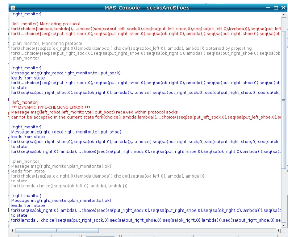
Fig. 5. The left_robot violates the protocol.

Besides describing the algorithm and its SWI Prolog implementation, we have shown some preliminary experiments in Jason with the running example "socks and shoes" where two local monitors with projected types are sufficient for verifying the whole system.