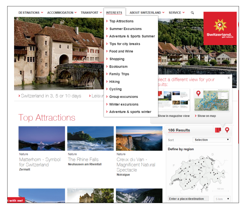
Fig. 2. Swiss touristic portal - menu of interests