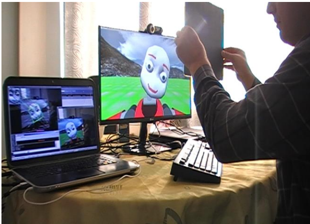
Fig. 2. The iCubSim robot following its own image in the mirror

For the iCubSim image processing (we rotate a printed picture of iCubSim in front of the camera) we employ the SURF method. SURF provides projection of given template to the image seen from which we can easily calculate inclination of the template. For the processing of human image (interacting person is moving his head in front of the camera) we use combination of Haar face detector and CamShift tracking: the Haar detector detects face in the upright position and sets up template for CamShift to track. The projection of the template to the seen image calculated by CamShift provides us with the required head inclination. All algorithms employed are available in OpenCV library ( www.opencv.org ).