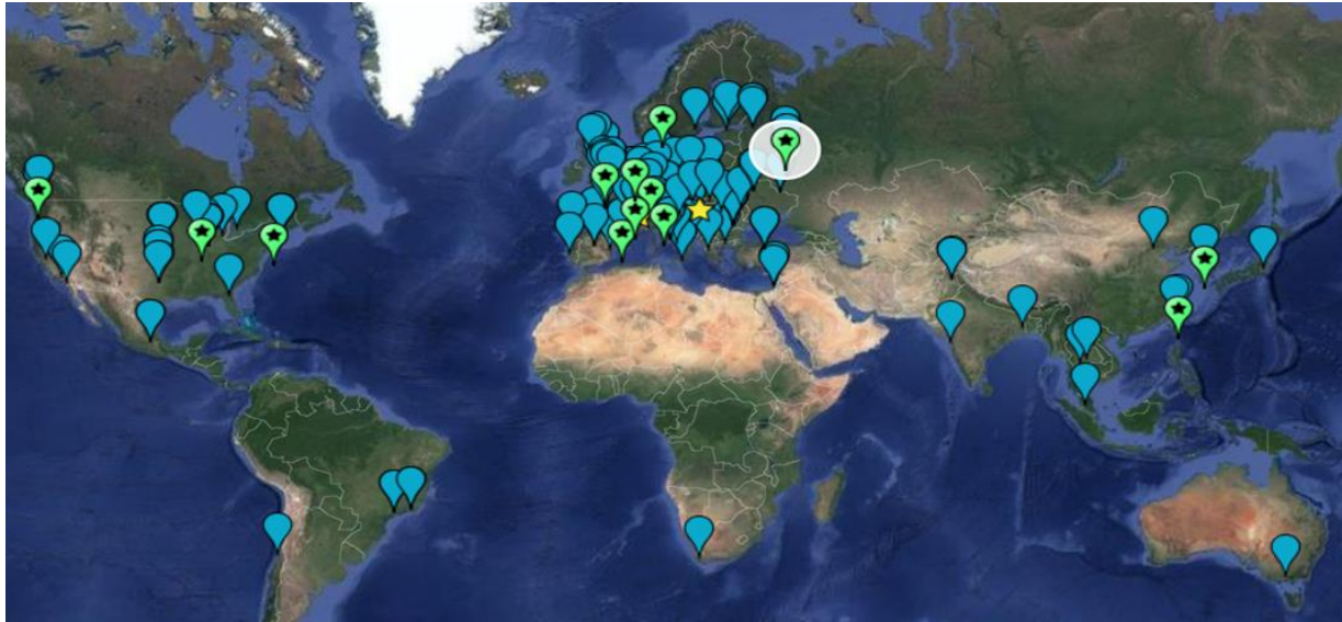
Figure 1. Worldwide LHC computing Grid (WLCG) global infrastructure. The JINR Tier1 centre is marked with a white circle

The current state of computing in high-energy and nuclear physics over the past 15 years is mainly determined by the distributed computing infrastructure created for processing and storing data of the LHC experiments. Each of four experiments, i.e. ATLAS, CMS, Alice and LHCb, represents not only a unique and sophisticated scientific tool, but also a collaboration, each comprising several thousands of scientists from several hundreds of institutes located all around the world.