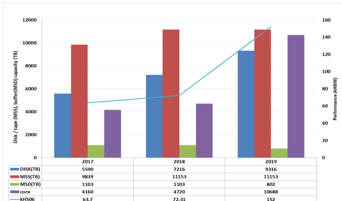
Figure 3. Evolution of the JINR CMS Tier1 main resource parameters

supported by the dCache-5.2 and Enstore 4.2.2 software. The total usable capacity of disk servers is 10.4 PB; the IBM TS3500 tape robot is 11 PB. The evolution of the JINR CMS Tier1 main resource parameters for the last three years is presented in Figure 3.