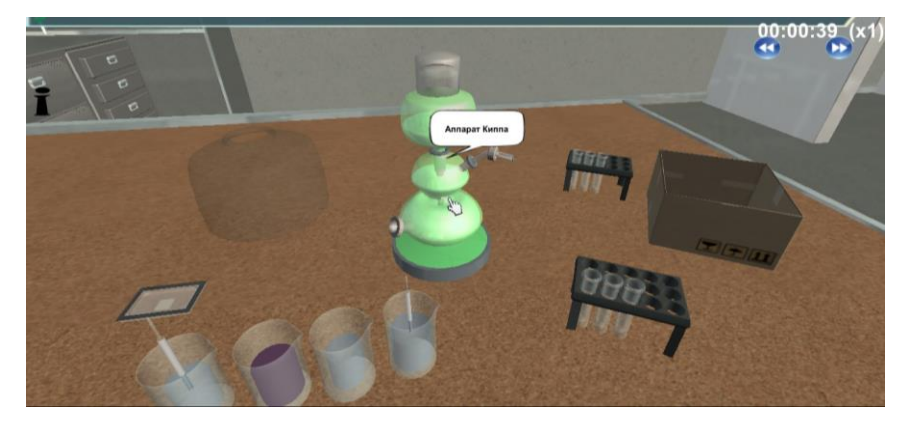
Fig. 2. Virtual chemical experience

To create a virtual chemical laboratory, the following tasks have been solved by the project executors: