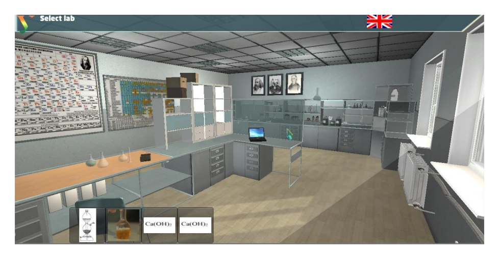
Fig. 1. Virtual chemical laboratory

A virtual laboratory workshop on General Chemistry was developed at the Engineering School of Information Technologies, Telecommunications and Control Systems of the Ural Federal University. It is a simulator of a chemical laboratory (see Fig.1), in which the user can move around the entire working space, interact with objects located on tables and shelves, select and perform a laboratory work. The development of the virtual laboratory is described in detail in the article [2].