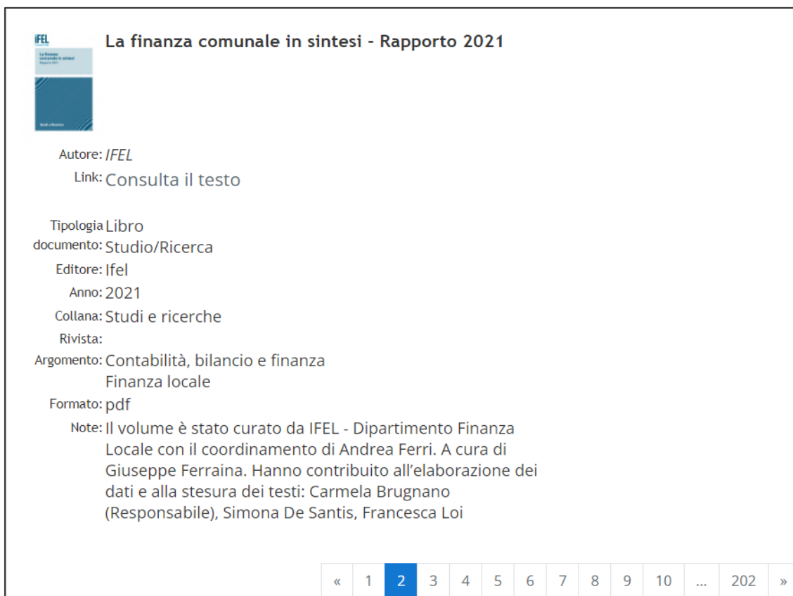
Figure 3: Digital Library: example of a full record