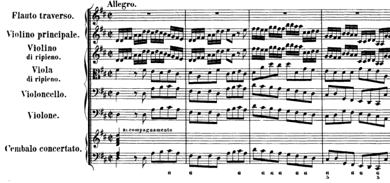
Figure 1: Incipit of the Brandenburg Concerto No.5 in D major, Johann Sebastian Bach.

to record, edit and play music. While MIDI is more focused on connectivity and music playback than to actually representing symbolic content, more recently MusicXML[6] has been proposed as an XML-based format for encoding western musical notation. It is intended for the exchange of music documents across different scorewriters and other applications. The Music Encoding Initiative (MEI) 6 is a community-driven, open-source effort to define a system for encoding musical documents in a machine-readable structure. Like MusicXML, MEI is encoded as an XML language, but includes a more advanced representation of notations beyond the common western one (e.g. mensural and medieval neume notations).