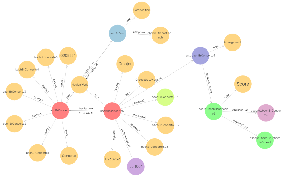
Figure 2: Fragment of the knowledge graph describing the concept of composition, musical work and score, with a focus on a published score.

oa:Annotation is used to declare an annotation and its metadata, including the creator and the datetime. The annotation is linked to a target and a body. The former is any given musical element in a score, being it a note, a noteset, a measure, a part or the whole score, or others. On the other hand, the latter is the actual content of the annotation, specifying its value, its format as well possible further metadata, e.g. language. In the following, an example is shown of a fingering indication which is created by a user and attached to a note: